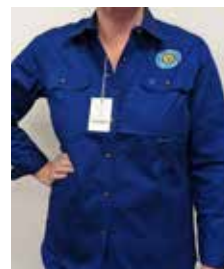
Full button workshirt (100% cotton): $45.00