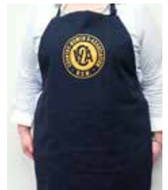
CWA Apron (poly/ cotton): $17.00