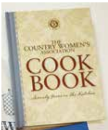
CWA Cook Book: $20.00 or $252 for 14