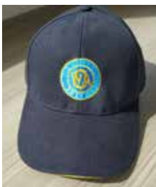
CWA cap (100% cotton): $15.00