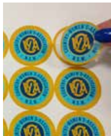
Stickers, 4cm (45 pack): $5.00