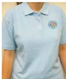
Pale blue polo (poly/cotton): $34.00