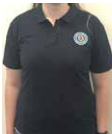
Navy polo (poly/ cotton): $34.00