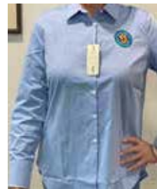
Business shirt: (97% cotton): $60.00