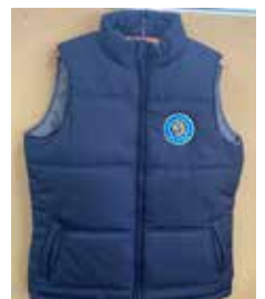
Puffer Vest (polyester): $60.00

All shop items will be available for pre-order pick up at Conference. See February journal for more information.