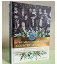
Country Women who...: $49.00