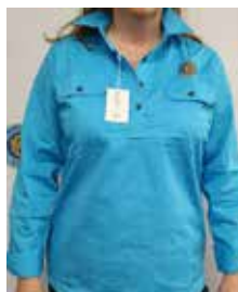
Half button workshirt (100% cotton): $45.00