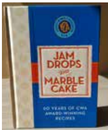
Jam Drops...: $16.00 or $280 for 20