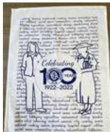
100 year tea towel: now $7.00 each