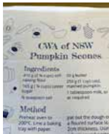
Pumpkin Scones: $12 or $160 for 20