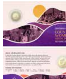
100 year coin: $12.50